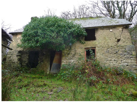
“Clom” walls: Lletty Du Uchaf

However, conventional solutions recommended to treat damp in traditional buildings often serve to exacerbate rather than solve the problem.