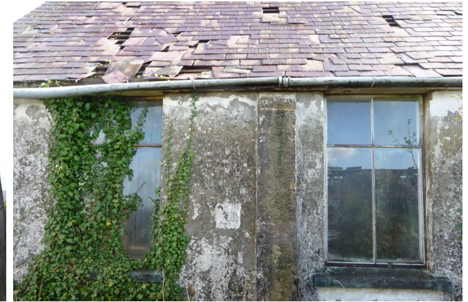
Above, left: Cracks in cement render