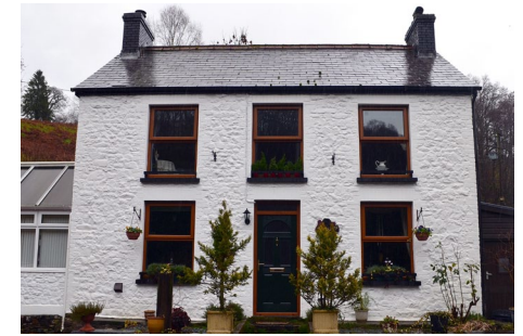
Modern impermeable materials: Carmarthen

naturally when conditions become drier. Evaporation prevents solid walls from becoming continuously damp, but this crucial function is compromised by the use of impermeable materials.