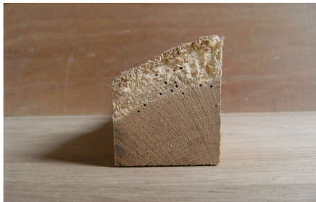
Left, top: Dry-rot fungus Left, below: Insect infestation (woodworm) Right: Thatch, lime plaster and limewash: Aberdeunant, Llansadwrn

conduct heat far more rapidly than dry walls. This leads to increased heat loss during cold weather and rising heating bills.