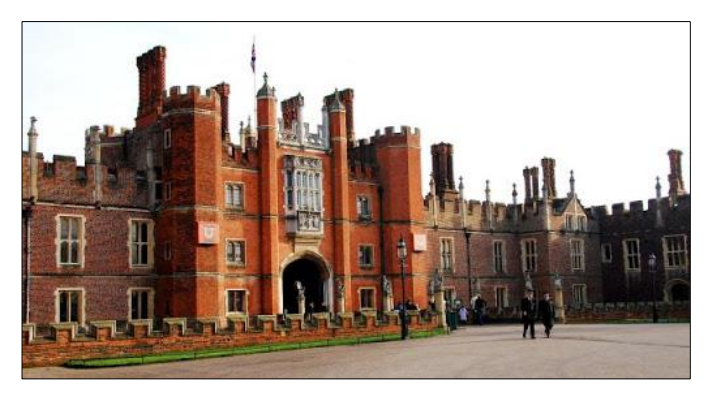
Hampton Court Palace