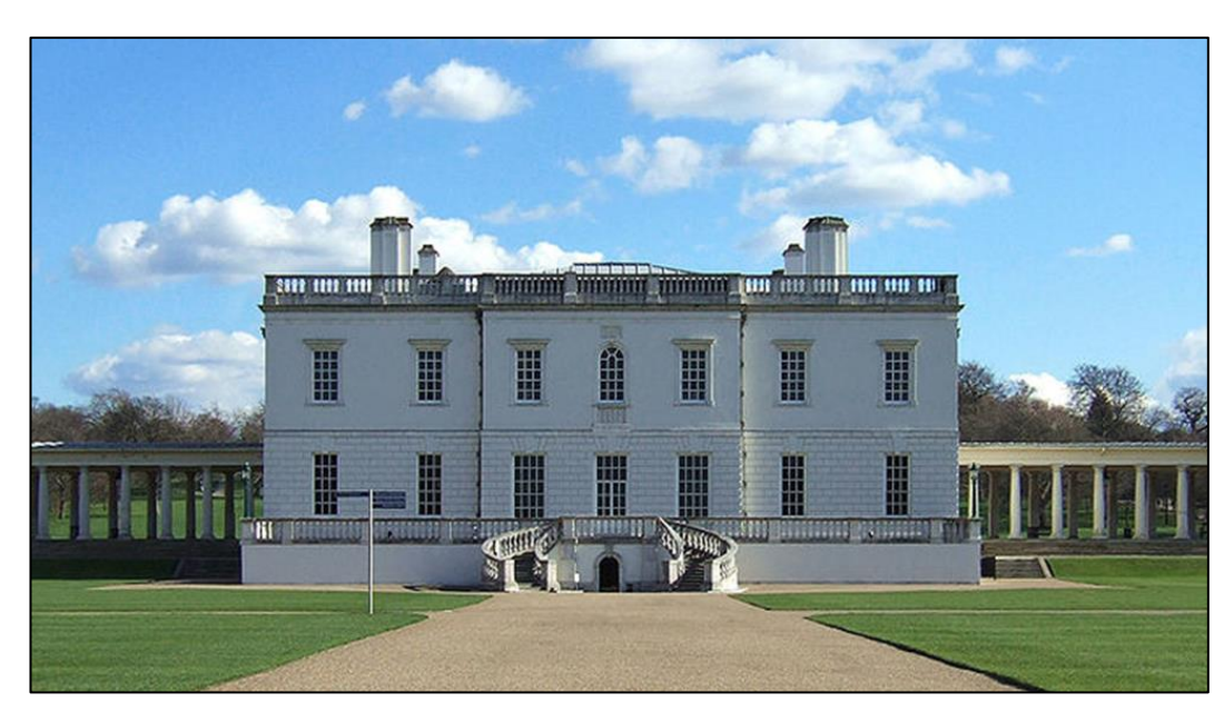
The Queen's House